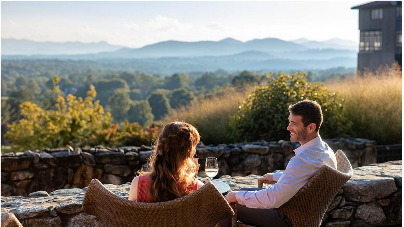
Blue Ridge – Farm-to-table concept with creative Southern cuisine